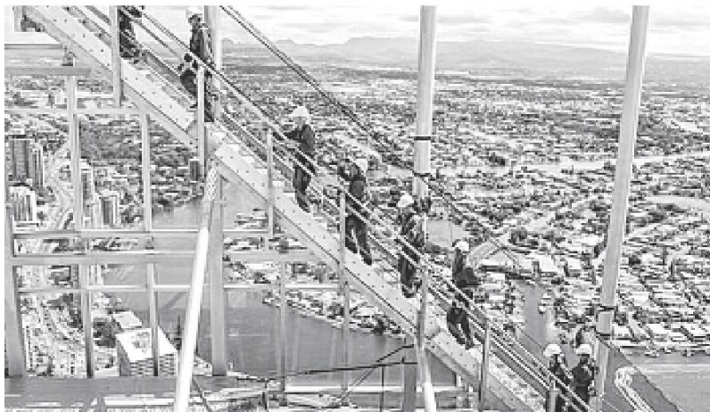
SkyPoint Climb is Australia's highest external building walk with breathtaking 360 degree views of the Gold Coast region. KIT DE GUYMER