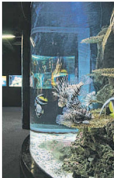
Find 5,000-plus fish in the Cleveland aquarium , opening this month. GREATERCLEVELANDAQIUM

Details: www.africanart.org , momath.org , www.911memorial.org .