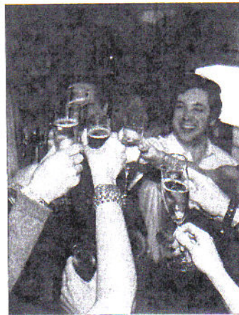
By Jeremy Swanson

Beer fanatics flock here because "Portland has more breweries than any other city in the USA, and they take their beer very seriously," Cockrell says. "Start in the center of the city and let breweries like the Lucky Labrador Brew Pub and the famous Deschutes Brewery Portland Public House set the route for your bar crawl." The latter is a classic beer-going spot that serves craft-brew icons and small-batch experimentals. 800-962-3700; travelportland.com