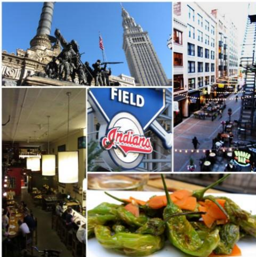
Gateway District- Downtown Cleveland, Photo by: Trishna Patel

Turns out the joke’s on us. I discovered Cleveland to be a vibrant city that shed itself of any old, nagging perceptions a long time ago (the Lebron situation is debatable). But I was quickly won over by the city’s perfect blend of grit and charm.